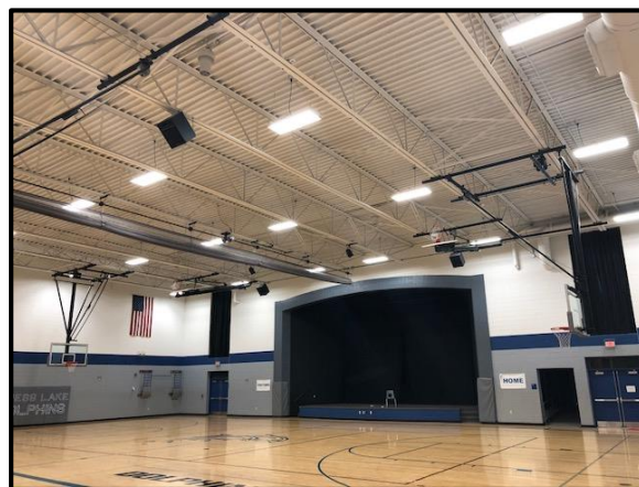
Gymnasium - LED Upgrade

By converting all interior and exterior lights to LED through fixture retrofits, this creates utility and maintenance savings while still maintaining recommended light levels for K12 schools. The energy savings was maximized in each space through an efficient lighting design and quality of the LED technology. Friess Lake will also receive a one-time rebate from Focus on Energy, Wisconsin utilities' statewide energy efficiency and renewable resource program. Other conservation measures included a Direct Digital Controls upgrade that will deliver greater comfort, air quality, efficiency, and extended HVAC equipment life.