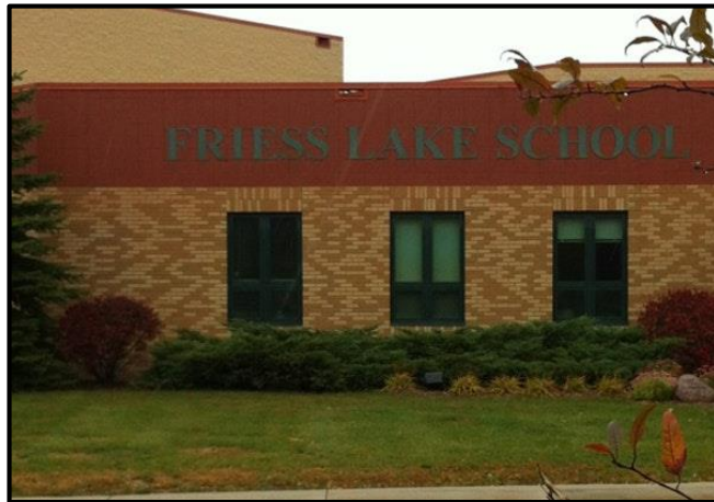
Friess Lake School

Friess Lake School is a public school District in Hubertus, WI. The one school in the district holds around 250 students ranging from Kindergarten through 8 grade. Friess Lake acknowledged the fact they needed upgrades to their interior and exterior lighting and HVAC controls in their building as well as an interest in building envelope improvements.