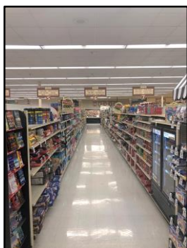
Isle Lights - After Retrofit