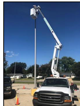
Exterior Lighting pole head LED retrofit

The lighting retrofit project eliminates the existing fluorescent lights and ballasts and provides new LED tubes that bypass the ballast. The ability to retrofit the existing fixtures keeps the project costs down so there is a better simple payback. The energy savings was maximized in each space throughout the store by selecting the proper LED tubes to deliver the recommended light levels according to the Illuminating Engineering Society (IESNA).