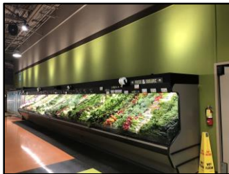
Produce Cooler - Before/After Retrofit