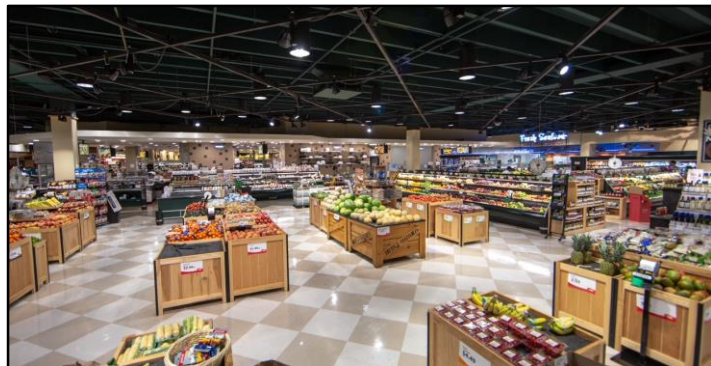
Hilldale - produce area after retrofit