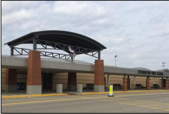
Stoughton Area High School

Stoughton Area School District is located in south central Wisconsin, just 15 miles southeast of Madison. It is evident that the community takes great pride in their public facilities, especially their schools, through a proven referendum track-record. This has afforded the district to build and maintain a Swimming Pool and Performing Arts Center. In 2017, the district made a commitment to save energy and maintenance costs related to these two spaces by converting their lighting to LED. The project included replacing and/or retro-fitting all fixtures with LED technology, designed to produce more light and significantly reduce the energy usage.