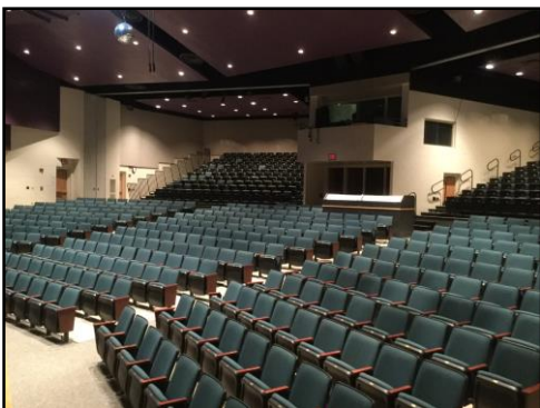
Performing Arts Center - After LED Upgrade